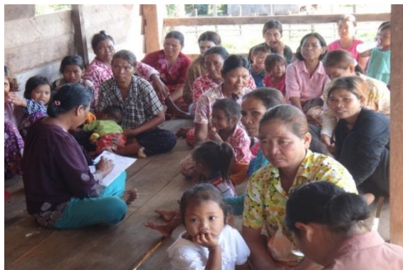
MFP conducted the meeting with community to register the members and prepare application form for CMG

After the MFP have got consultation recommendation from IME, and then they prepared and submitted the letter for set up the GMC to commune councilors and now the letter still in district office.