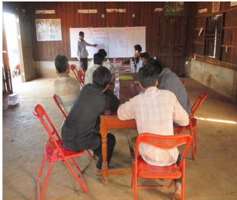
KCB led meeting to discuss forest issue