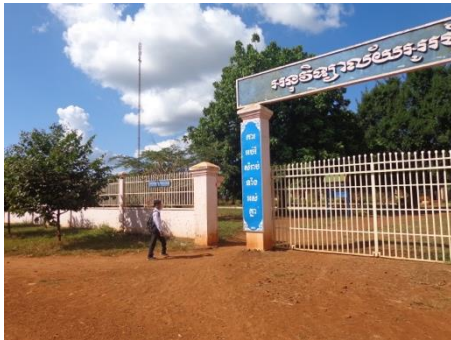
Kiv is entering the gate of secondary school

School Principals have been communicated regularly when there is project's activities at school. We usually attended monthly meeting with Committee Council for Women and Child (CCWC) at district .