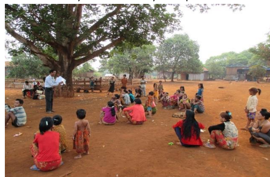
KCB consulted with community members about land and forest protection.

commune, after KCBs received information, they mobilized key community's representatives to conduct the investigation to stop the illegal actions at Yeak Poy community's forestry site, including issues of land grabbed, and artisanal mining at Koh Peak commune and so on. So far, it is noted that illegal actions, which normally committed by local authorities and perpetrators were reduced, as they are deterrent to the community's movement to make complaint against them. That's because the community