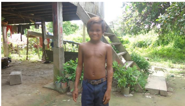
Tav after recovered from disease

The main objective of the project is to identify out of school children and conduct intervention in order to bring them back in school and retaining for full project life's